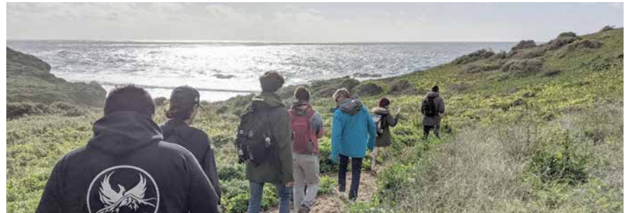
LTCC students at the oceanography field excursion in the spring.

Science lab courses are full-time students, Promise students, Equity students, and PELL grant recipients, so the cost of transportation to and from field sites is a significant barrier to their participation in these valuable educational opportunities. Thanks to the grant, 100% of the 25 students enrolled in LTCC's Oceanography course attended the March 2022 Monterey Bay field excursion. "While the direct outcome of this grant was to subsidize transportation to field locations, the ancillary benefits really help to support classroom learning and bolster interest in STEM related fields," says Scott Valentine, oceanography course instructor.