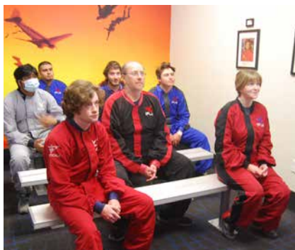
Students learning flight and safety training at iFLY before experiencing the wind tunnel.

Thanks to a $2,000 grant, LTCC physics students visited the iFLY indoor skydiving facility where they learned about the physics concepts that underlie skydiving and engaged in thrilling immersive learning experiences to apply these principles. The visit began with a seminar, where students learned about the forces that act on a body during free fall. The students then completed a hands-on laboratory activity where they calculated their own terminal velocities and received flight and safety training. Then, each student participated in three sessions in iFLY's famous wind tunnel, where they put their newly-learned physics concepts into practice!