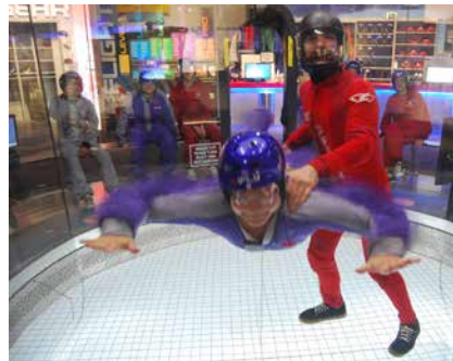
Student with instructor in the wind tunnel at iFLY.

In March 2022, when gas prices increased significantly, LTCC awarded a $2,000 Student Success Grant to subsidize travel costs for the Earth and Environmental Science Oceanography field excursion. The majority of students who take Earth and Environmental